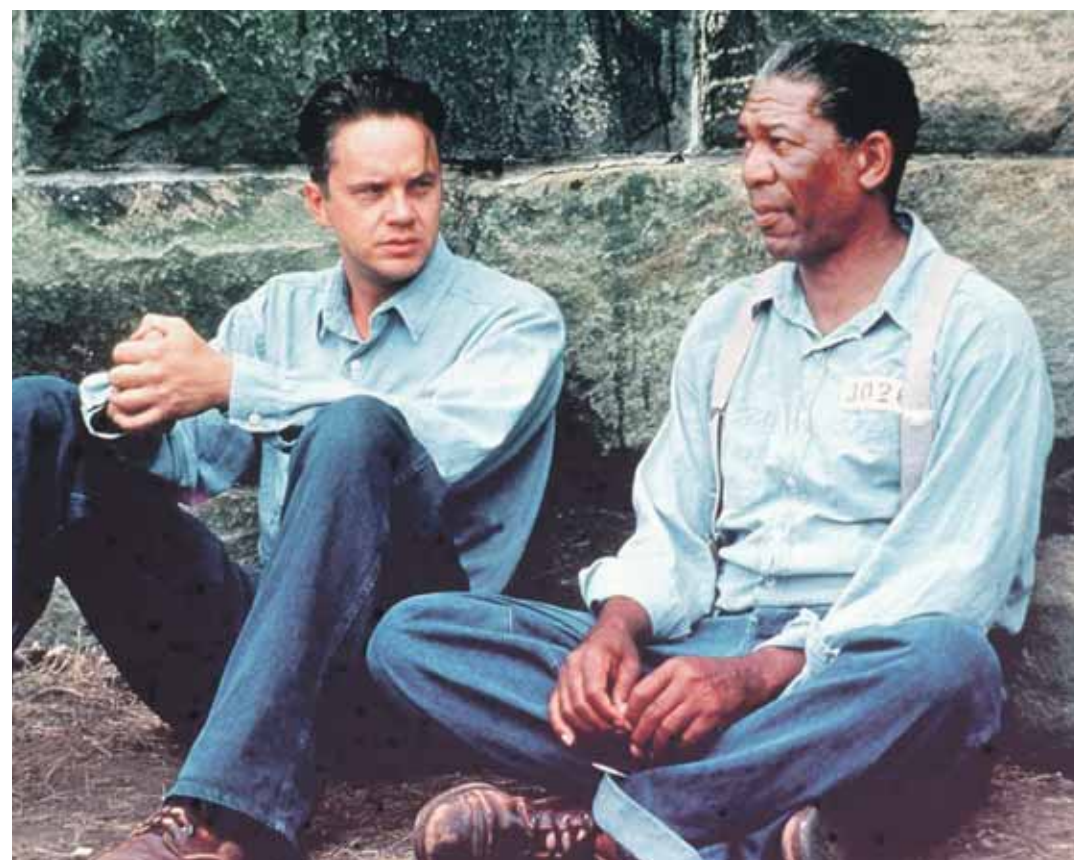
Tim Robbins and Morgan Freeman in the 1994 film The Shawshank Redemption .