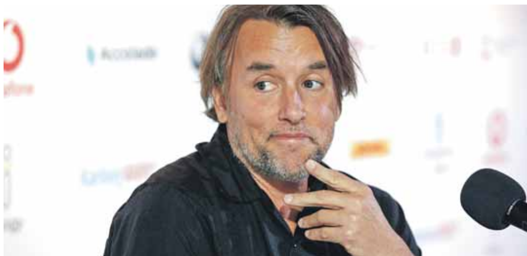
Richard Linklater will talk about the Austin Film Society during his KVIFF TALK.