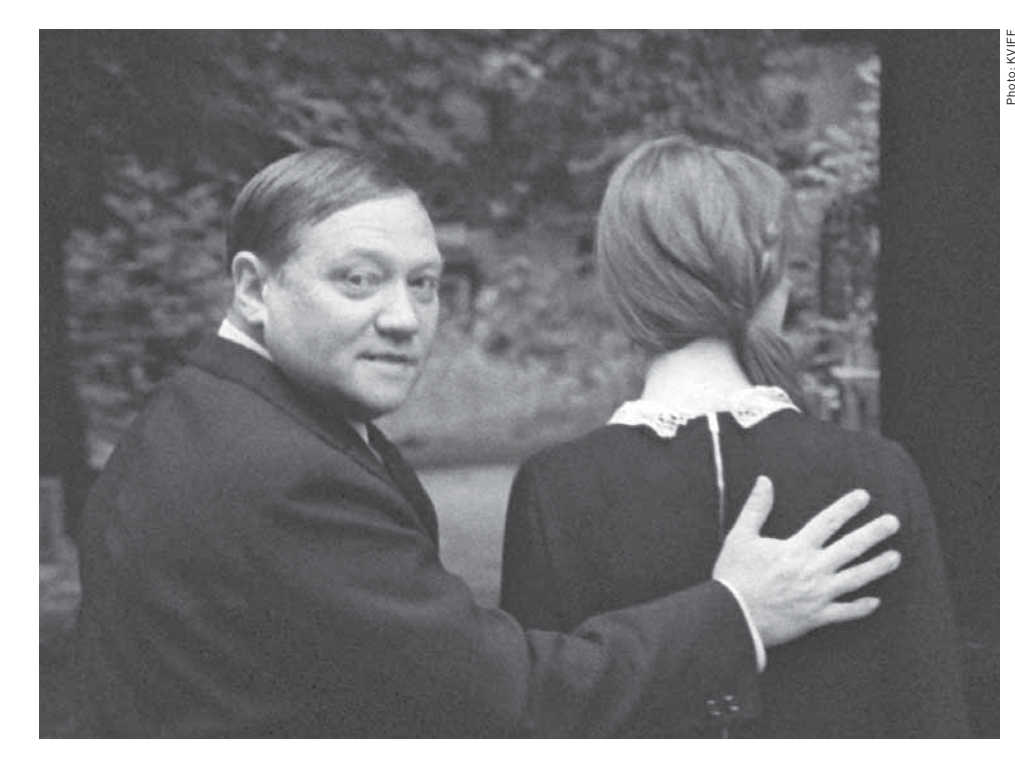
The Cremator premiered its digitally restored version at this year's KVIFF.