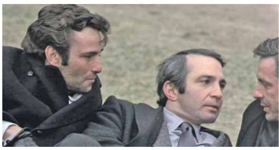
Three sheets to the wind. To be seen in Husbands.